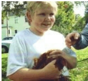
The Blessing of the Animals was held in the church garden. Eliot blessed a variety of animals.

For those interested, the Bishop's Address can be found on the diocesan website: www.diocesewma.org . The address points out, with a very clever surprise, that change is with us always. We will move forward in 2010, knowing that the eternal and immutable God is also with us always.