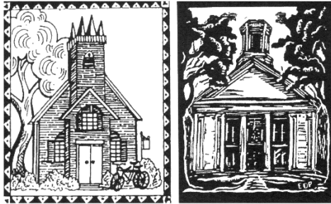
St. John's Episcopal Church, Ashfield